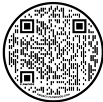
Mobile Home Title Application

If you have a mobile home or vessel you would like to title in Florida, there are separate title applications that must be submitted. Please use the QR codes below to access these forms.